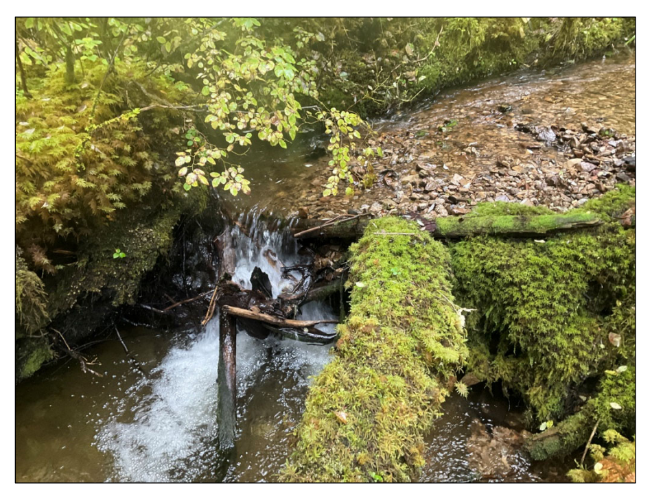
Figure 3.-Small falls at waypoint 918.