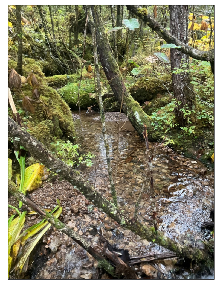
Figure 2.—Channel at waypoint 917.