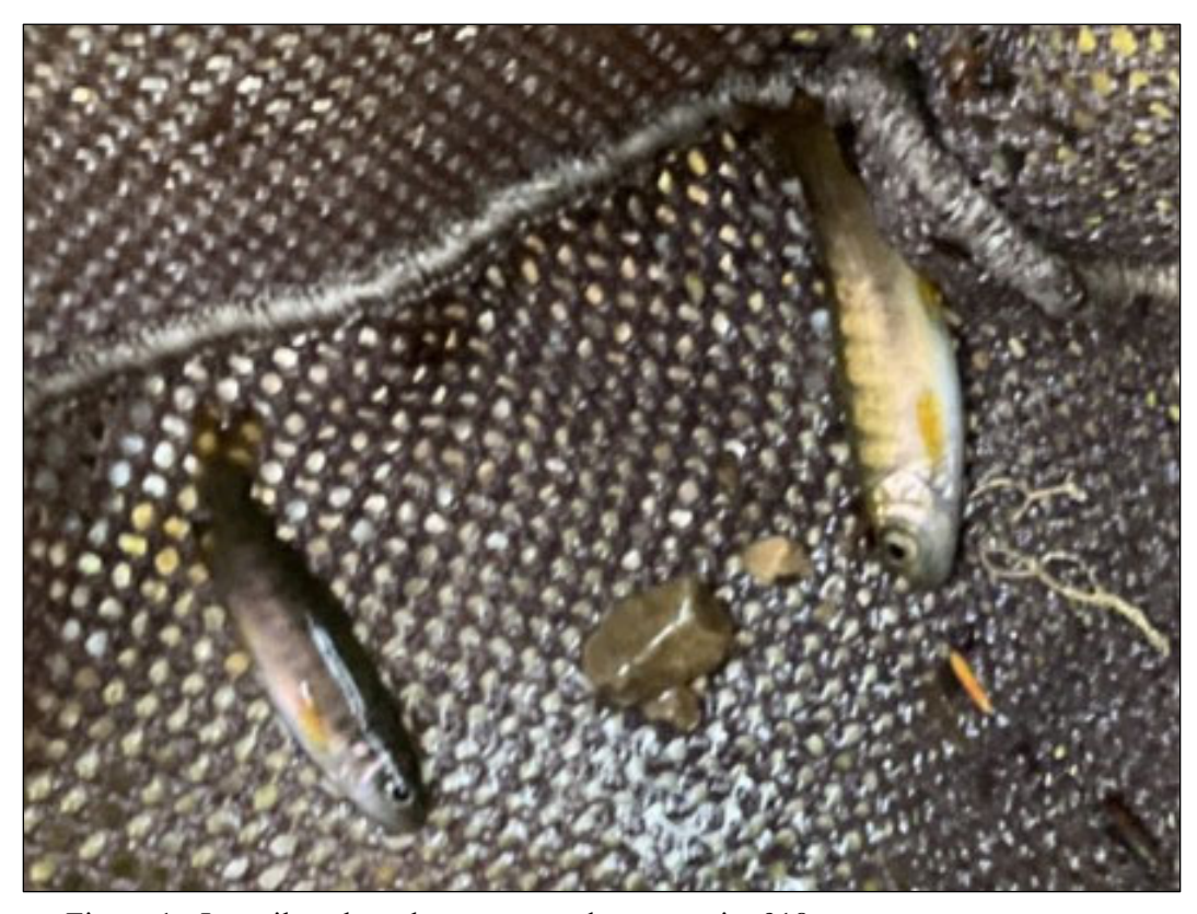
Figure 1.—Juvenile coho salmon captured at waypoint 918.